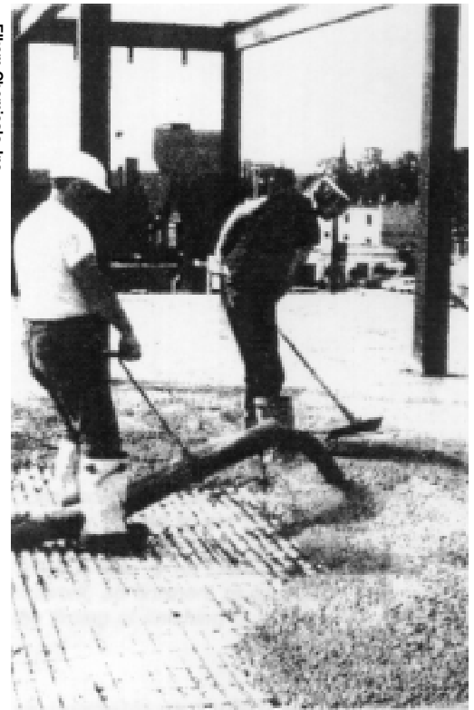
Superplasticized silica-fume concrete flows well. But even with slumps of 8 to 10 inches thorough consolidation by vibration is always needed.

prevent plastic shrinkage cracking also help prevent surface drying and hardening.