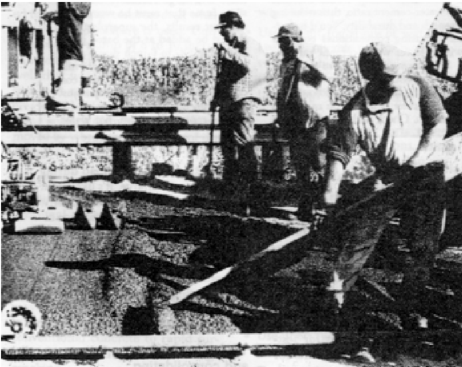
Elkem Chemicals, Inc.

Improving concrete with silica fume requires using the correct placing, finishing, and curing procedures